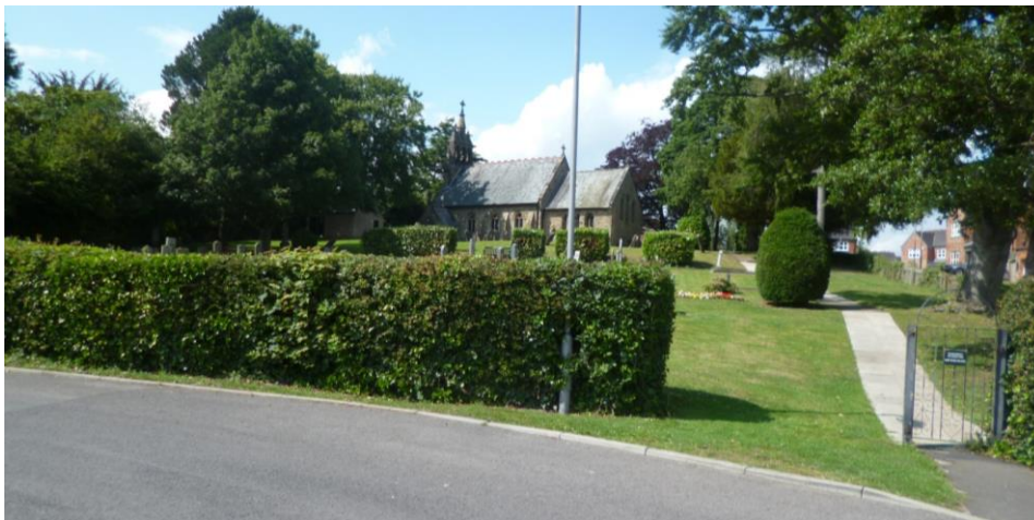
Photograph 1 – View of Church from Pump Lane